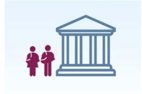
IF Individual Fellowships