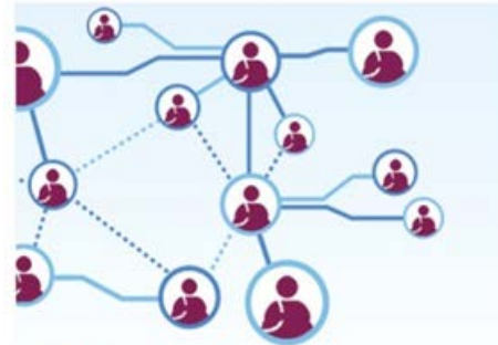
ITN Innovative Training Networks