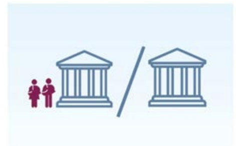
COFUND Co-Funding of Regional, National and International Programmes